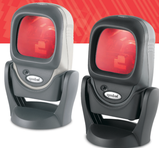
2005 Sunrise Date Compliant

In many applications, the feature-rich LS 9208 presentation scanner offers aggressive performance, maximum durability and optimal ergonomics to create a more productive POS environment. When you buy the LS 9208, you receive the added assurance of purchasing from Symbol—a company with proven solutions and millions of scanner installations worldwide.